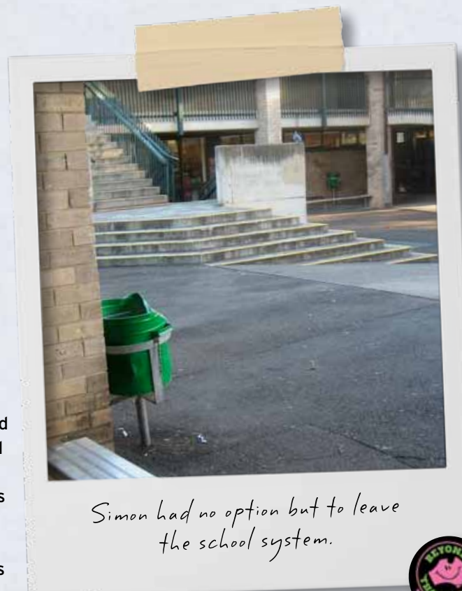
Simon had no option but to leave the school system.

"I remember being in a Year 10 Assembly and there were a few boys who were always the ring